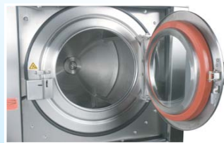
SP-40, 50, 65, 75, 85, 100

Loading and unloading are fast and easy through the oversized door that opens 165 degrees. The door is constructed of stainless steel, supported with a highly durable stainless steel hinge design and located at a convenient height for laundry carts. SP Series Washer Extractors with capacities up to 100 lbs are assembled with a silicone door gasket is designed for long life and seals to the shell every time without leaking. Also, SP Washer Extractors with capacities up to 100 lbs has a powerful, safe and easy to operate electro-mechanical door interlocking system. Washer Extractors with capacities over 100 lbs has a silicone door gasket that is safely pneumatically pressured providing extra sealing strength. Furthermore, SP Washer Extractors with capacities over 100 lbs are equipped with a highly robust, yet easy to operate mechanical-pneumatic door interlocking system.