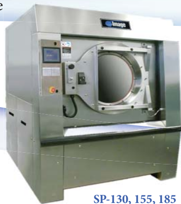
SP-130, 155, 185