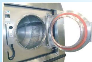
SP-130, 155, 185